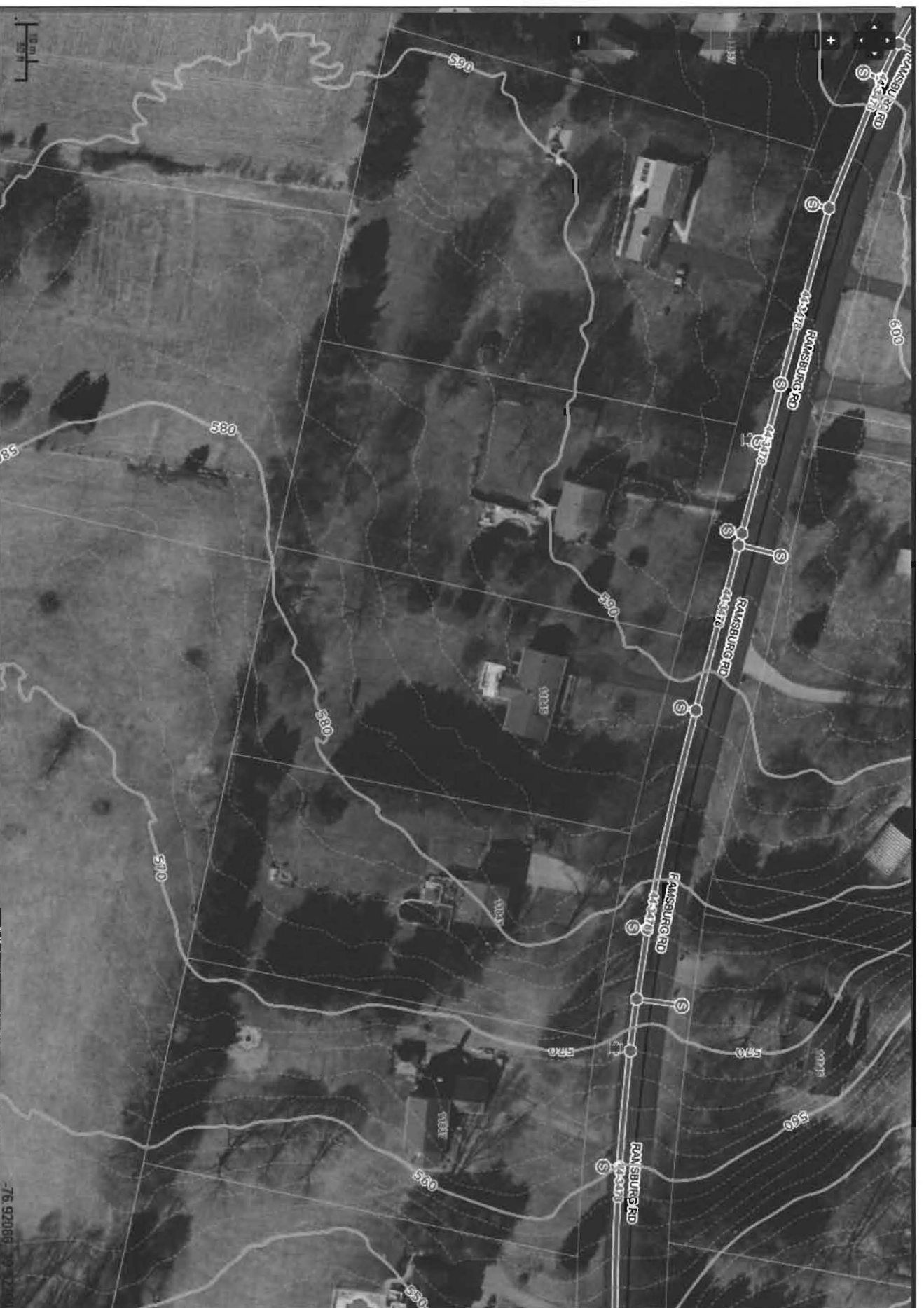
11849 Ramsburg Road – site layout for repair. Glenelg Loam soil