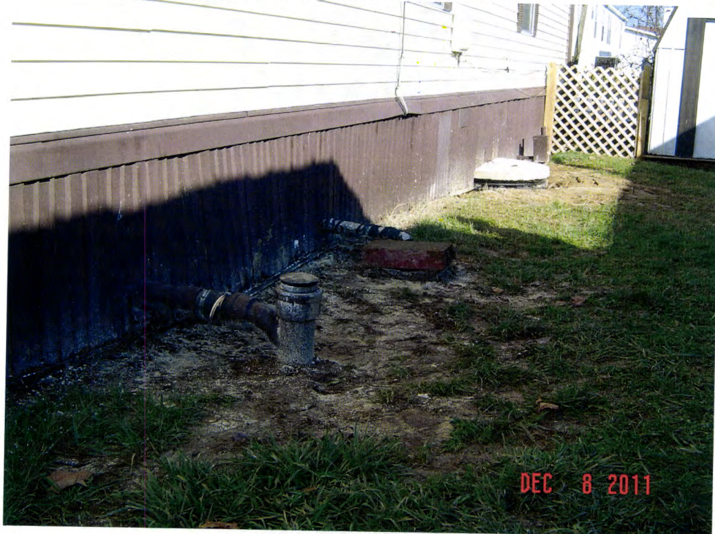
Trailer sewer connection