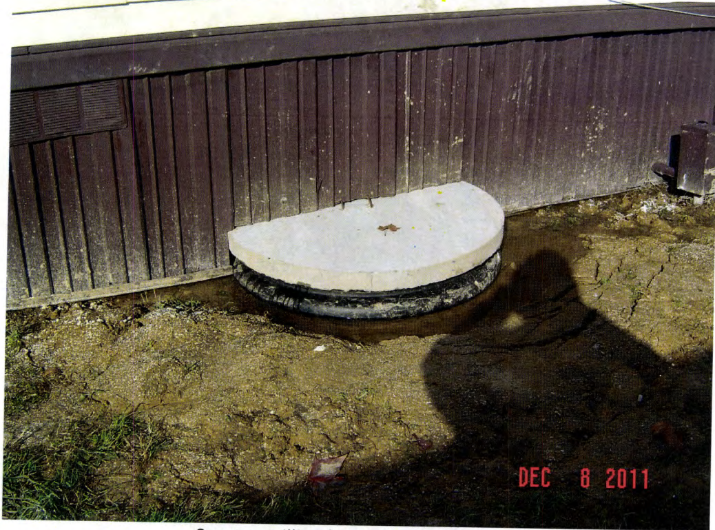
Sewage spilling from some kind of tank