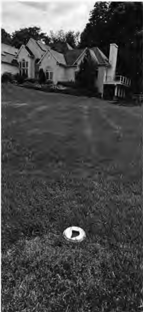
Septic tank clean-out with broken lid.

Site visit – 6/10/25 15050 Frederick Road Woodbine, MD 21797