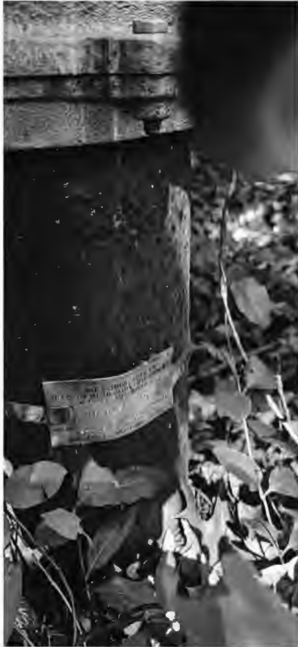
Well tag # HO-94-1725

Site visit – 6/10/25 15050 Frederick Road Woodbine, MD 21797