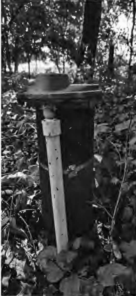
Well with broken conduit, missing bolt in cap and seal hanging out.

Site visit – 6/10/25 15050 Frederick Road Woodbine, MD 21797