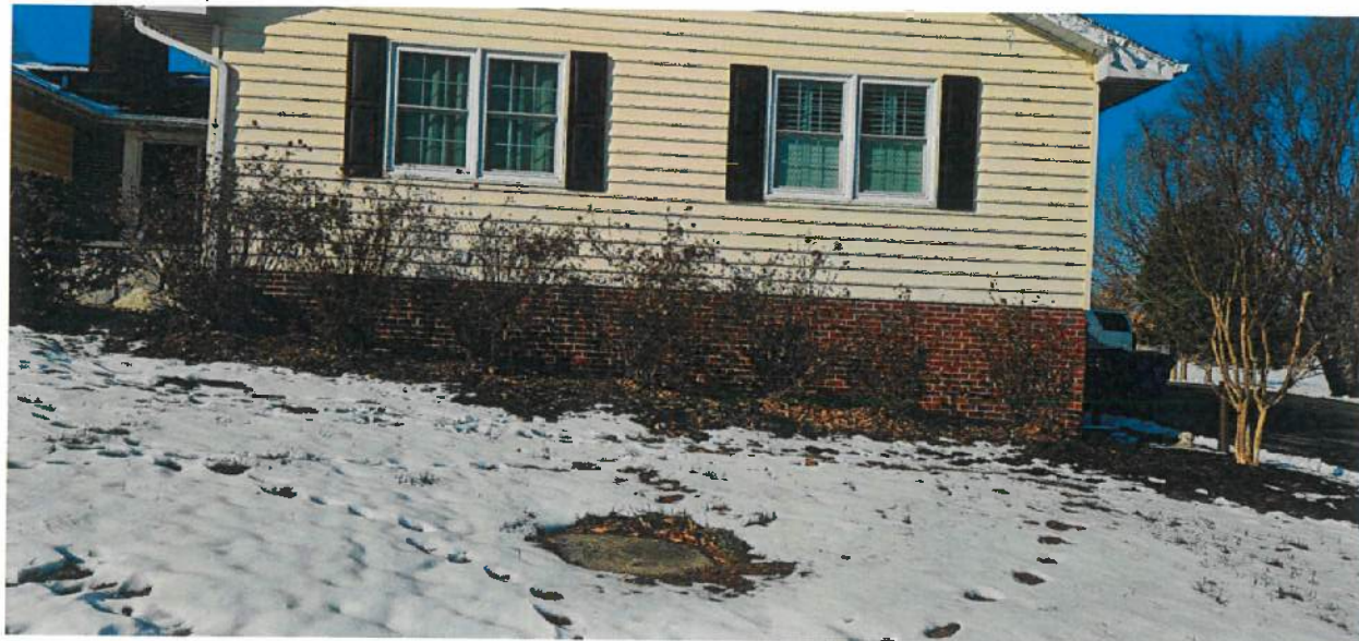
Septic tank man hole cover in front.

Site visit – 12/18/25 1260 Driver Road Marriottsville, MD 21104