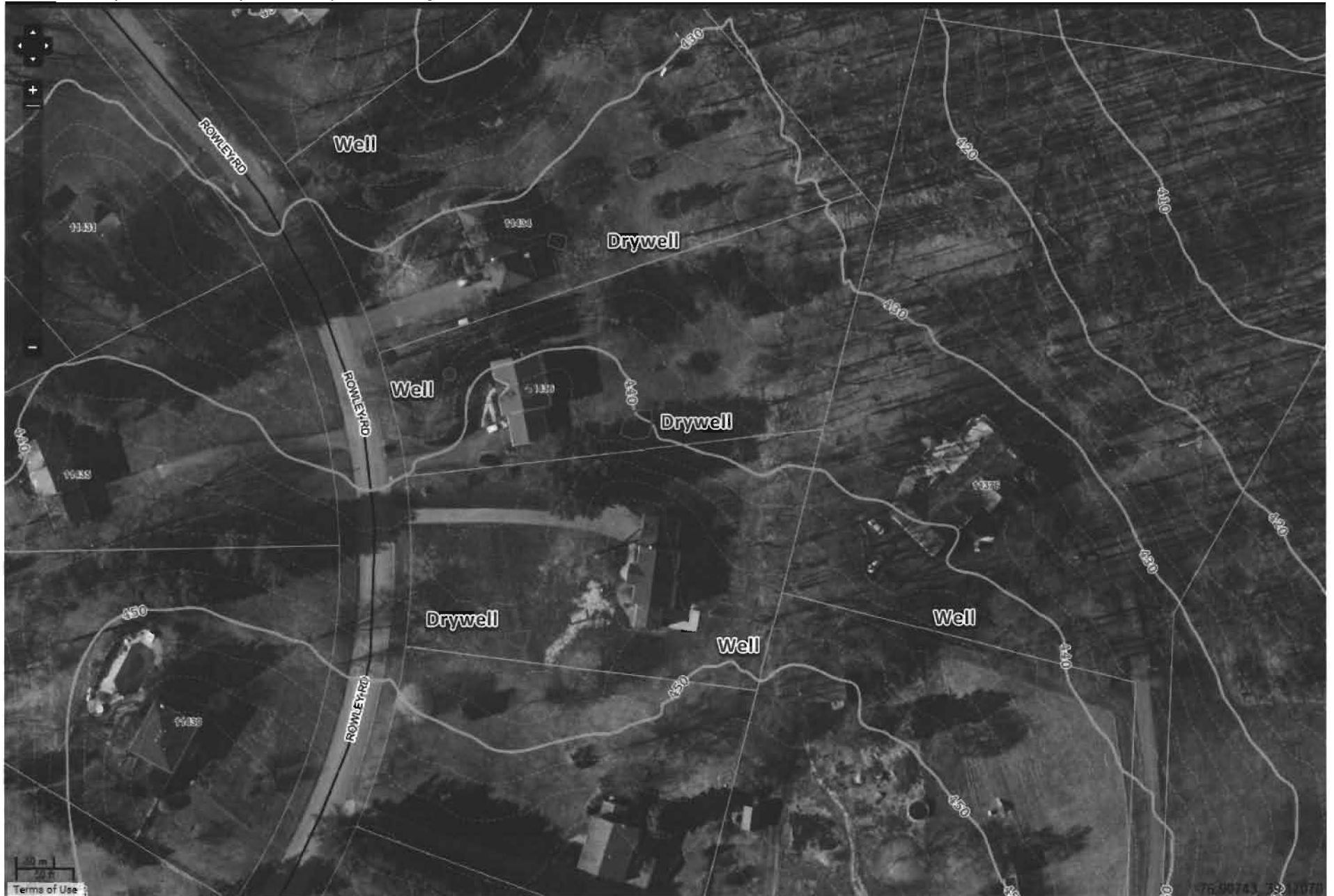
11436 Rowley Road – site layout for Repair. Genelg urbanized soil