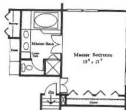
Optional First Floor with Master Bedroom

APPROVED WALK-THRU BUILDING PERMIT BP# _____ Williamsburg Design A# _____ APP. SAN. Sealed DATE: 5-1-18 DESC. OF WORK: Redesign Bathroom Approved as shown