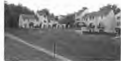
View of Existing Property