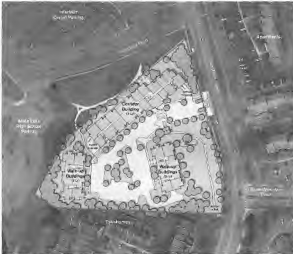
Concept Site Plan