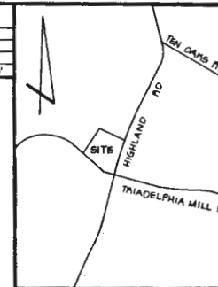
VICINITY MAP SCALE: 1"=1200'