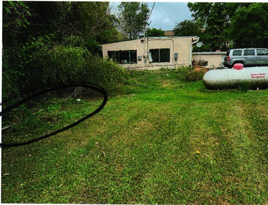
C/O, manhole, & location where sewer was seen above ground