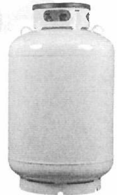
118 GALLON ASME 6762.11 420 LB DOT 1499TC.11