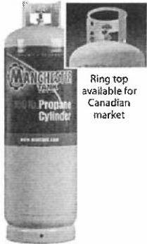
100 LB (POL VALVE) 1428