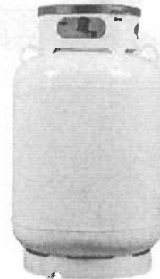
57 GALLON ASME 6765.11 200 LB DOT 14205TC.11