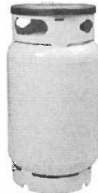
28.6 GALLON ASME Manchester's 'MINI' 68143